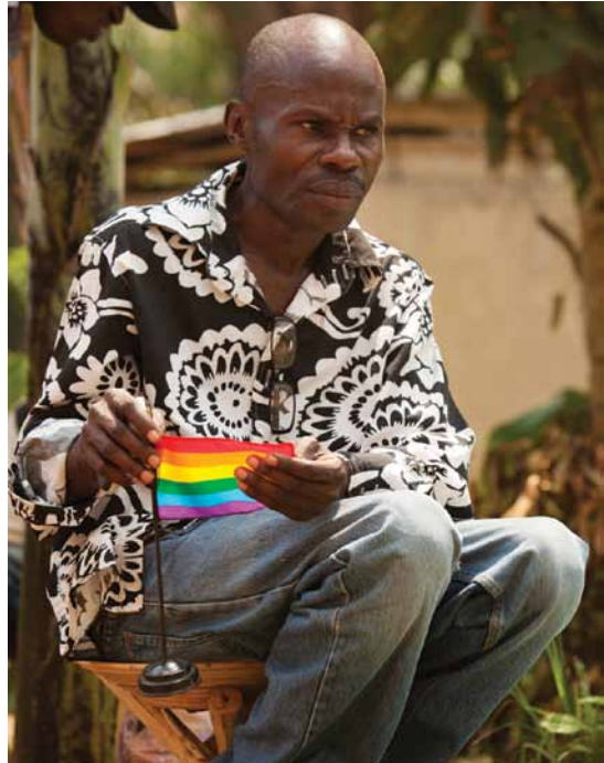
Call Me Kuchu

Titles originate from independent filmmakers and prominent producers alike. Select content partners include HBO, CBC Learning, BBC, the Dramatists Guild, Journeyman Pictures, and IFC Films/Sundance Selects. Newly added,