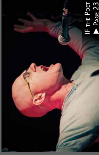
IF THE POET ▶ PAGE 23