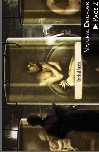
NATURAL DISORDER ▶ PAGE 2