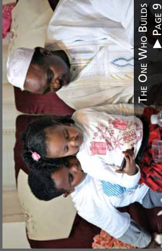
THE ONE WHO BUILDS ▶ PAGE 9