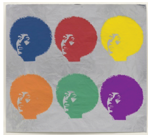
"Angela Libre" by Elizabeth Catlett, 1972.