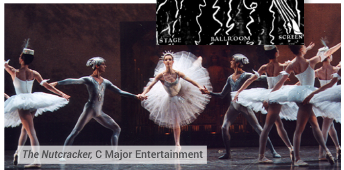
The Nutcracker, C Major Entertainment