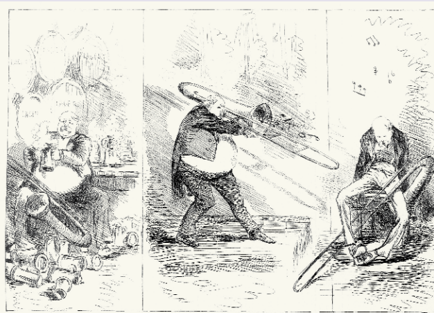
LEON VON SZILLES, THOSE THE GREAT TRUMPETER, PERFORMS A SOLO AT THE WORLD'S PEACE JUBILEE.

The first greatest parts of to thousands sound? When they are hushed to quietude part for the considered selves, or the great ensemble power of thousands