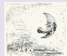
MADE IN THE SOON APPROXIMATE OF THE JUBILEE.

For more information, please contact the publisher.