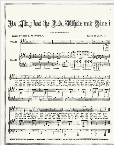
The Boston Musical Times , (Boston, 1861)