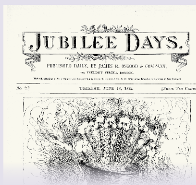
Jubilee Days (Boston, 1872)