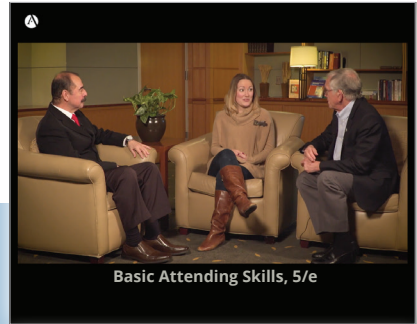
Basic Attending Skills, 5/e