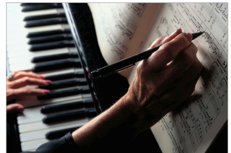
For those who prefer physical copies, majority of scores may be printed