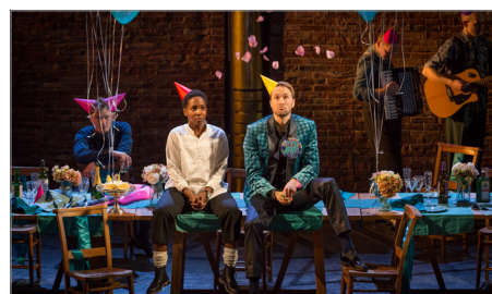
Ensemble cast in Twelfth Night (Marc Brenner)