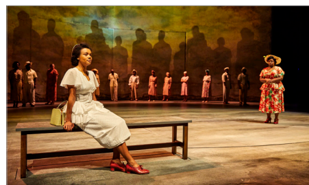
Leah Harvey and Shiloh Coke in Small Island (Brinkhoff Moegenburg)