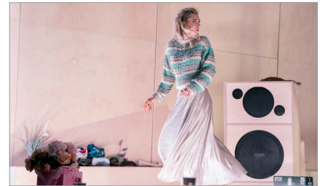
Vanessa Kirby stars in Julie