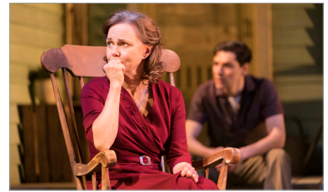
Sally Field and Colin Morgan in All My Sons