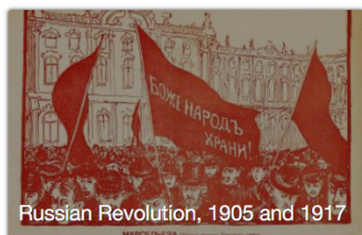
Russian Revolution, 1905 and 1917