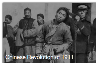
Chinese Revolution of 1911