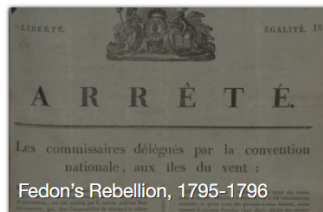
Fedon's Rebellion, 1795-1796