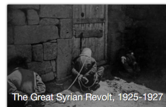
The Great Syrian Revolt, 1925-1927