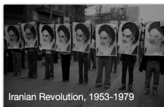
Iranian Revolution, 1953-1979