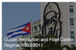
Cuban Revolution and Fidel Castro Regime, 1953-2011