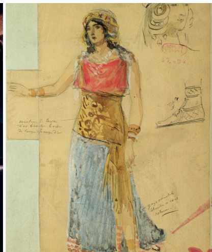
Costume design for Isolde in 'Tristan und Isolde', by Richard Wagner, 1865.