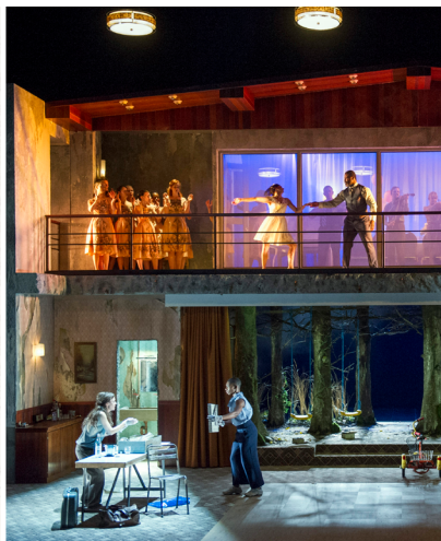
Still from the National Theatre's production of Medea (2014). Accompanying archival Costume Bible provides costume details.