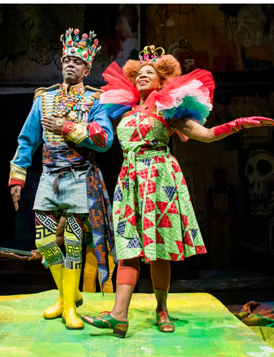
Hamlet, Royal Shakespeare Company, 2016.