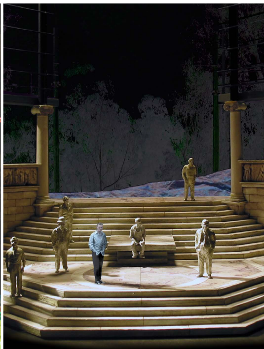
3D Model: Front View, with Darko in Ralph Funicello Personal Papers (Pericles) (2002).