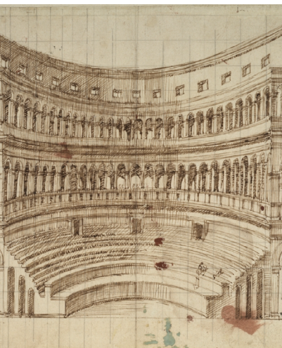
Amphitheatre designed by Inigo Jones, 1610.