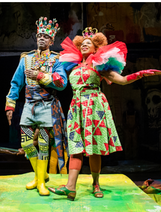
Hamlet, Royal Shakespeare Company, 2016.