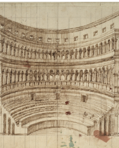
Amphitheatre designed by Inigo Jones, 1610.