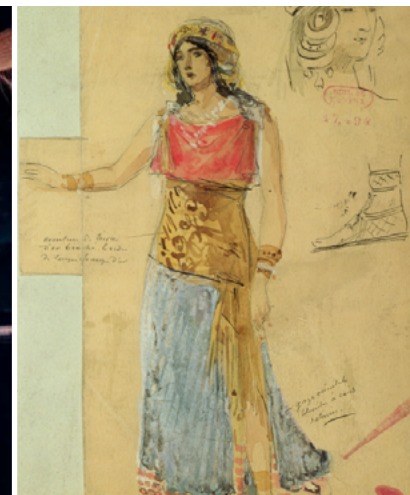
Costume design for Isolde in ‘Tristan und Isolde’, by Richard Wagner, 1865.