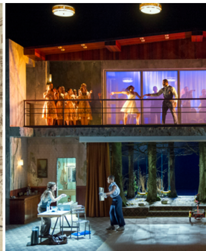
Still from the National Theatre’s production of Medea (2014). Accompanying archival Costume Bible provides costume details.