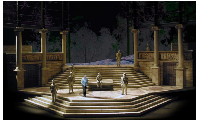
3D Model: Front View, with Darko in Ralph Funicello Personal Papers (Pericles) (2002)

Theatre Performance & Design Collection contains the full collections of: