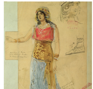
Costume design for Isolde in 'Tristan und Isolde', by Richard Wagner, 1865