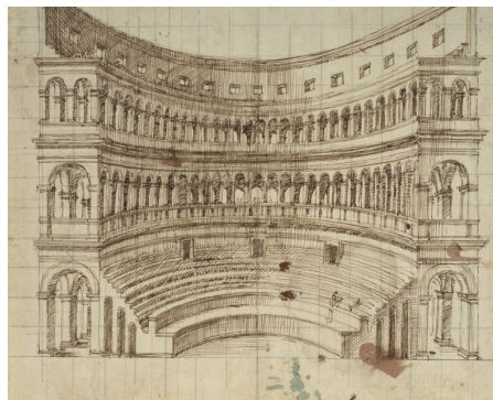
Amphitheatre designed by Inigo Jones, 1610