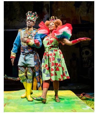
Hamlet, Royal Shakespeare Company, 2016