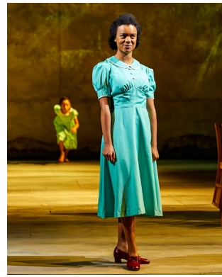
Small Island, UK's National Theatre, 2019