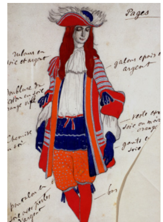
Costume Design for The Page in 'The Sleeping Princess', c.1921 designed by Léon Bakst