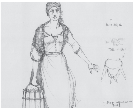
Suttirat Anne Larlarb's costume sketch for the UK National Theatre's production of Frankenstein , 2011