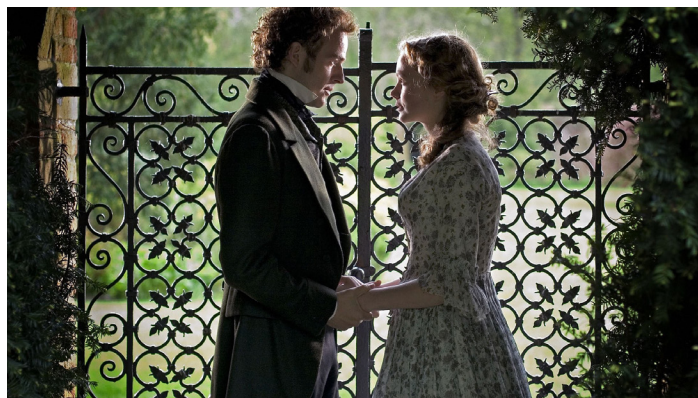
Patrick Kennedy and Carey Mulligan in the BBC adaptation of Bleak House.

BBC Literary Adaptations in Video is a treasure trove of BBC productions, with nearly 200 hours of video, much of which was buried in the BBC archive for decades. From Dickens to Shakespeare, Chekhov to Arthur Miller, Jane Austen to Mary Shelley, more than 50 famous literary works are included. Talent like Mark Rylance, Yoko Ono, John Gielgud, Sir Ian McKellen, Colin Firth, and more make this product a must-have. In addition to performances, the collection includes titles like Face to Face with actors and writers discussing their craft. Ideal for use in Drama and Performing Arts classes to analyze their craft or specific performances, and English/Literature classes to support the teaching of literary works.