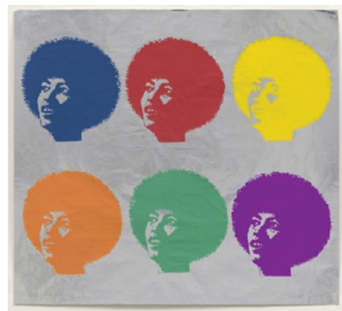
"Angela Libre" by Elizabeth Catlett, 1972.